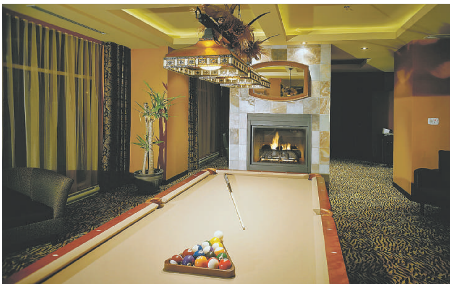
Common areas at the Villagia de l'Île Paton in Laval include this multi-purpose room with pool table, perfect for get-togethers.

Villagia prides itself on its customer service, which is personalized from the moment you set foot on the premises. A boutique hotel-style reception desk greets arrivals, and the concierge on site is there to help with any aspect of your move – from moving heavy boxes, arranging your furniture, to customizing your electrical needs. The events and activities di-